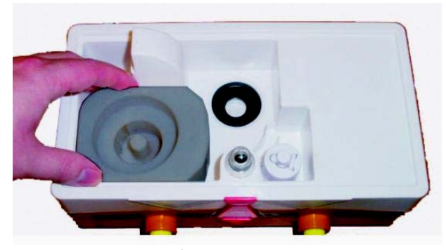
Fig. 10 A

Filters are not included with the humidifier and can be purchased separately.